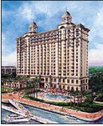
The Westin Savannah Harbor Resort ~ The Headquarters Hotel for the APS Meeting.